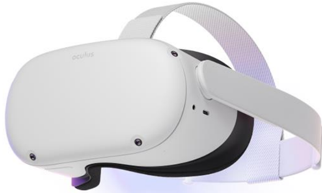
Meta Quest 2