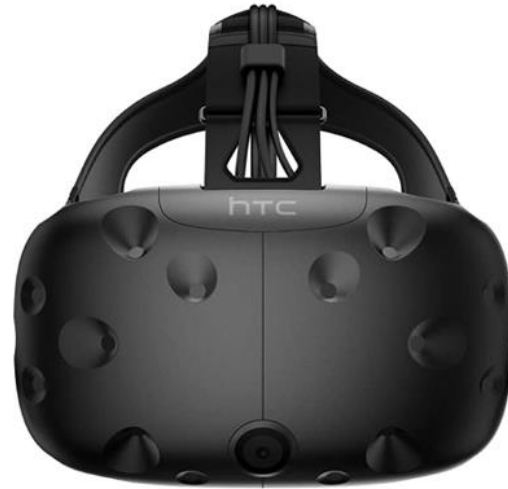
HTC Vive *