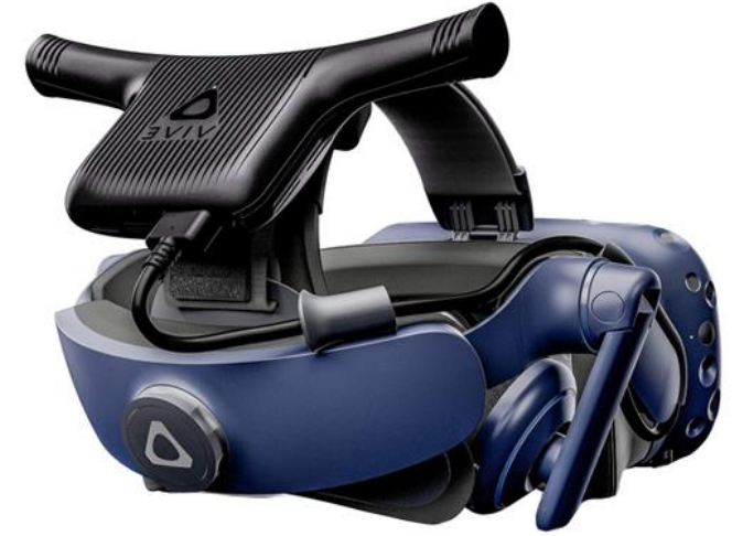
HTC Vive Pro Wireless *