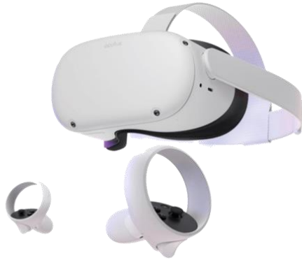
Meta Quest 2